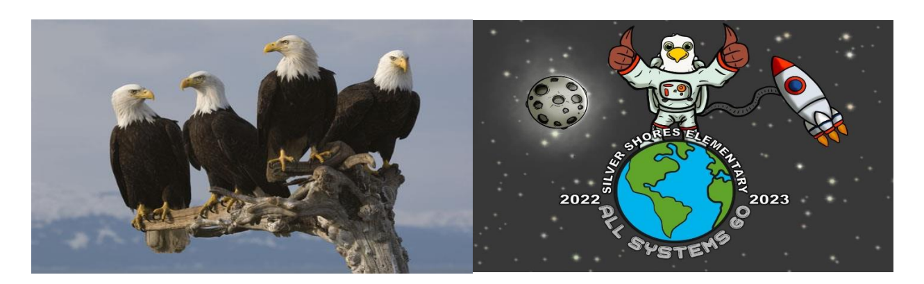
August 16, 2022